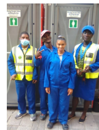
Streetscapes Partnership With CCID