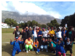
News From The Sports field