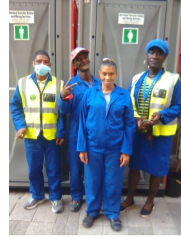
Streetscapes Partnership With CCID