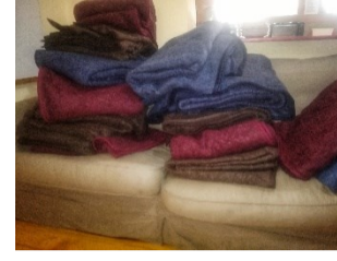
Blankets for Africa!