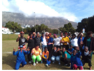
News From The Sports field